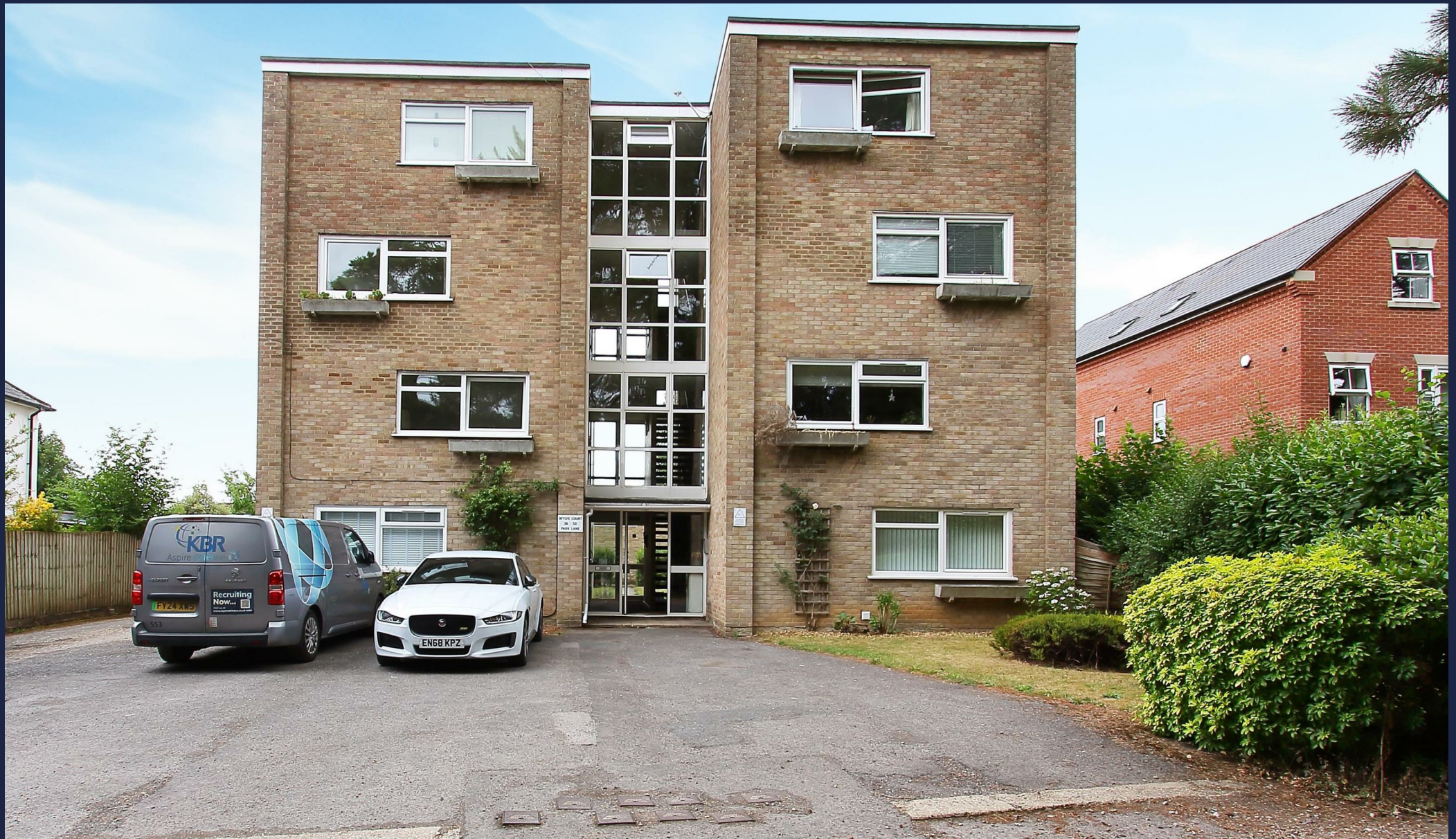
36 Wylde Court, Salisbury